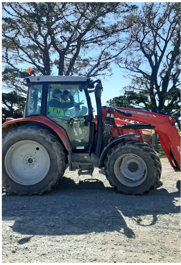
Churchill Street P O Box 94 Pahiatua