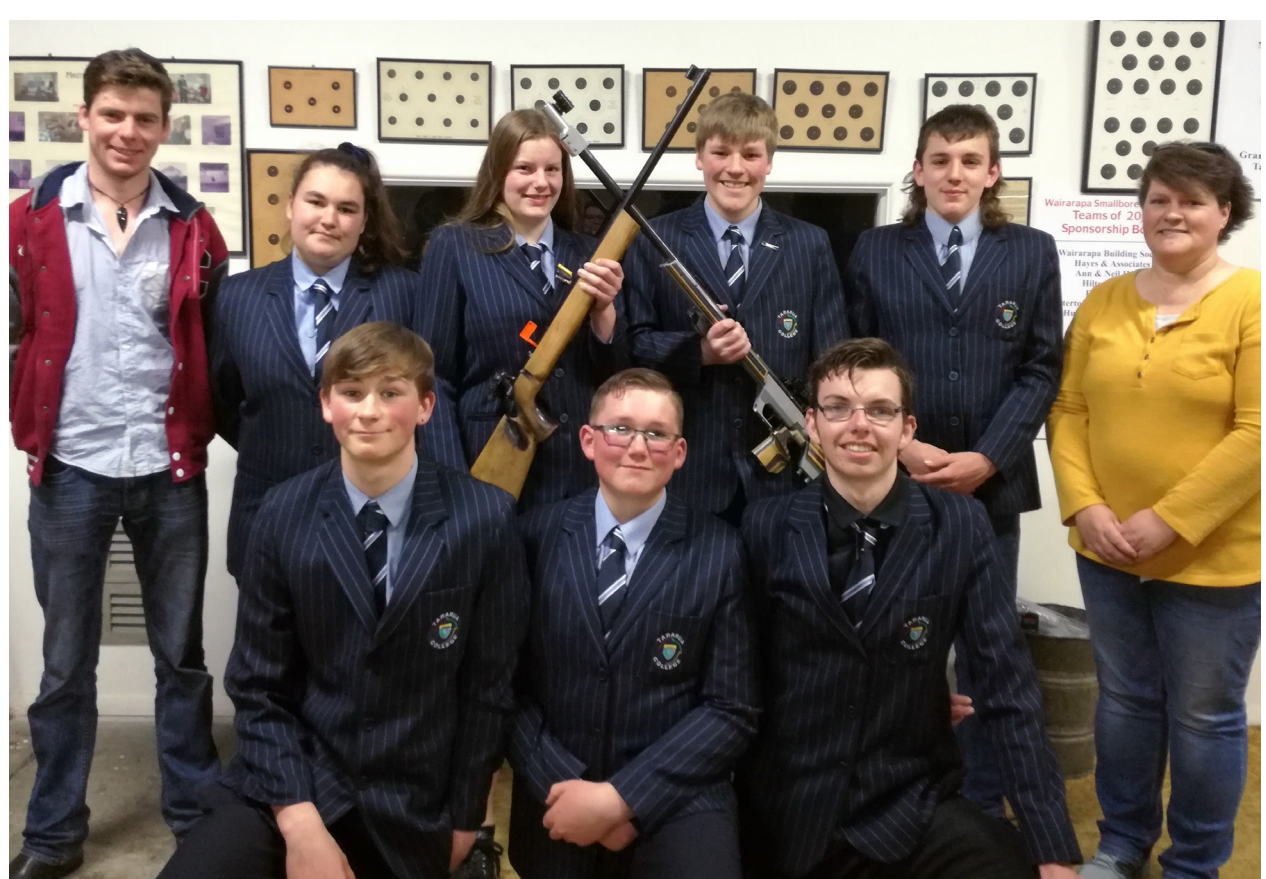
TC Small Bore Shooting Team