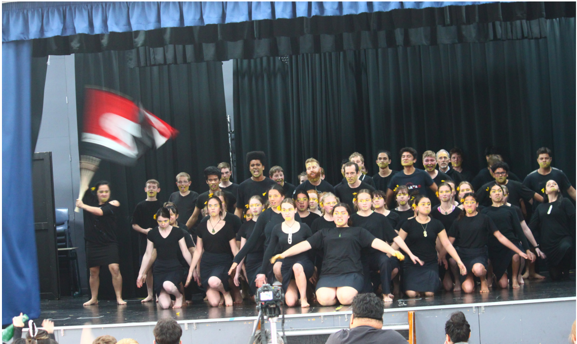
Kōwhai House's winning performance

We recently held our House Kapa Haka Competition. This year's winners were Kōwhai. The friendly rivalry almost brought the house down. The passion was truly alive. We thank our judges who certainly had a difficult job this year, and Kapa Haka was the winner on the day.