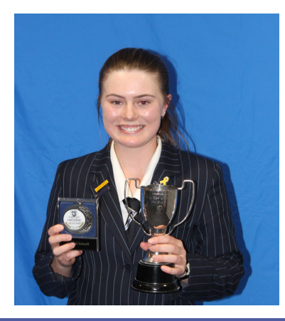
Facebook: Search: Tararua College