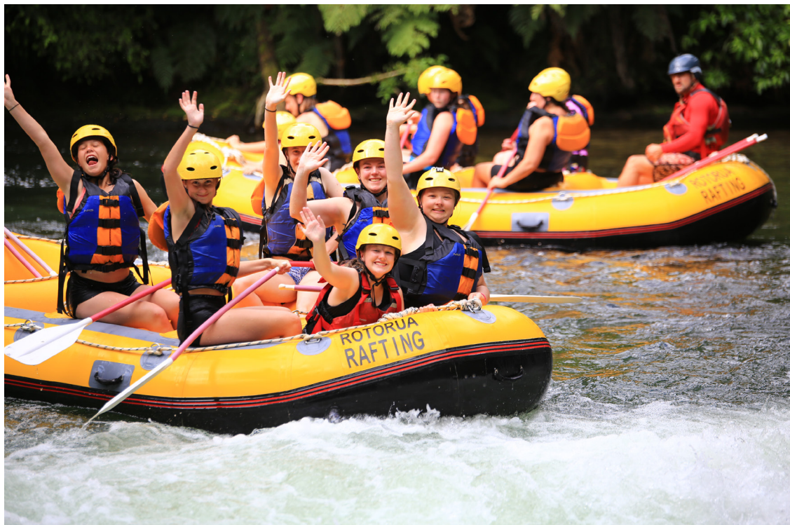
RAFTING FUN ON ELECTIVES